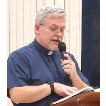
JUNE 14 – SAT. 10:00 am HISTORICAL CURRENTS in ANGLICANISM

worshipers spanning 132 years. These accumulated prayers seem to linger, creating an atmosphere ripe for personal encounters with God.